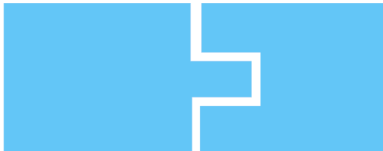
Perimeter cutting and surface